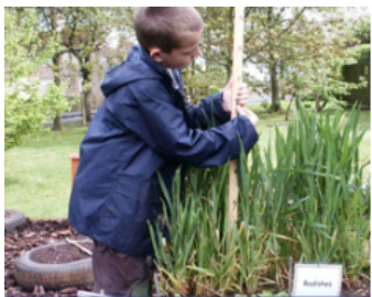
Developing skills THROUGH the environment

Under the umbrella of Cambridgeshire Outdoors, CEES works with other providers to encourage and enhance high quality learning outside the classroom.