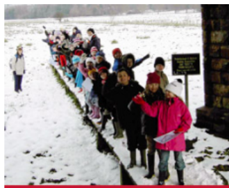
Offering first-hand experience IN the environment

CEES aims to bring learning to life by working with schools to: