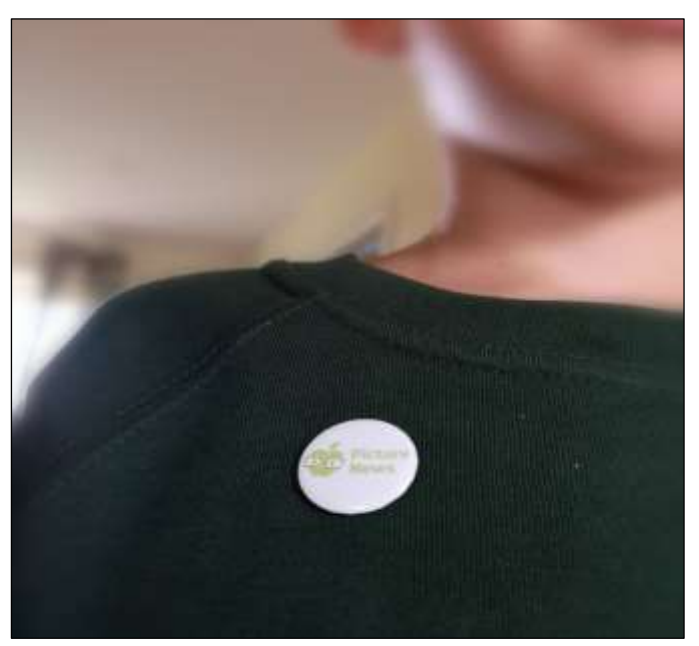
Pictured: Picture News monitor badge

Please note: Any pictures sent through may be used on our social media or feature in this paper. If your Picture News monitor badges didn't arrive, email us and we'll send them through!