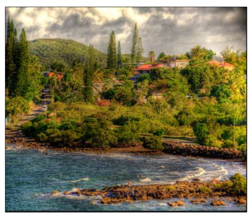
Pictured: The Island of New Caledonia where the Pycnandra acuminata trees are being studied.

Researchers at the University of Queensland have been studying special trees in the South Pacific called Pycnandra acuminata. These trees have evolved to take up the normally toxic metals into their stems, leaves and even seeds. It is thought that the trees may use nickel to defend against insects. It means that the trees latex has a blue-green colour as it contains up to 25% nickel. Some scientists are hopeful that the trees might be used to clean toxic material from soil in polluted areas.