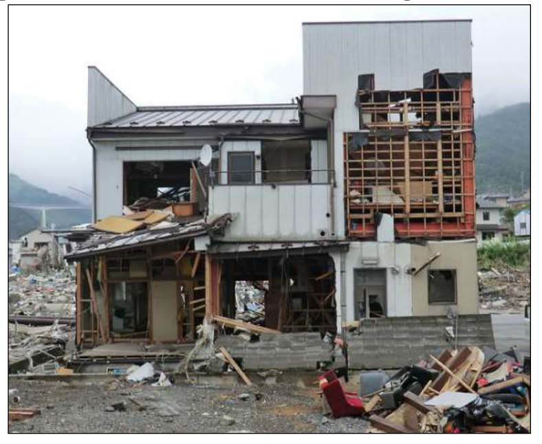
Pictured: An example of the destruction an earthquake can cause.

Japan is one of the most seismically active nations and accounts for 20% of guakes worldwide of magnitude 6.0 or more.