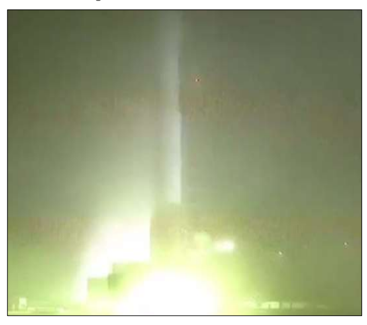
Pictured: The probe as it launched.

These tremors should reveal how the underground rock is layered and give data that can be compared with Earth which will hopefully give us more knowledge about the history of Mars!