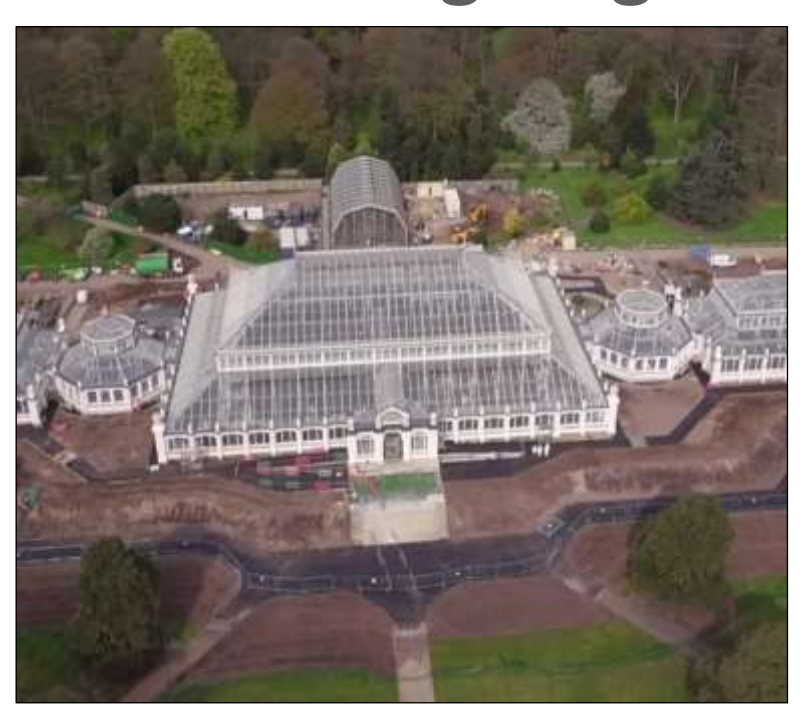
Pictured: The greenhouse at Kew Gardens.

Kew Gardens in West London is to reopen Temperate House which is the world's largest glasshouse after a fiveyear period of work.